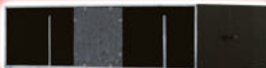
545-W.5 SUBWOOFER SYSTEM

Since its founding in 1979, High Performance Stereo™ has become the motion picture industry leader in the development and installation of high efficiency, fully horn loaded loudspeakers. The quality and success of the HPS-4000® sound system has been based on the unprecedented performance of such speaker systems.